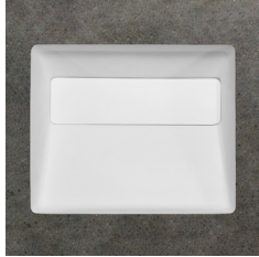
Sink with drain cover