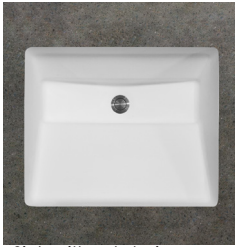
Sink without drain cover

The C1316-V vanity sink allow for a covered drain. The sink is provided without the cover and either a Gemstone can provide a matching cover cover plate, or the fabricator can create a 1/2" coverplate from the countertop material. The water is able to drain around the edges of the plate.